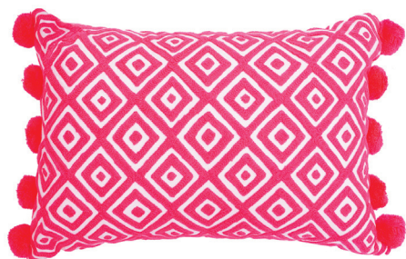
CUSHION £39.50, bombayduck.com