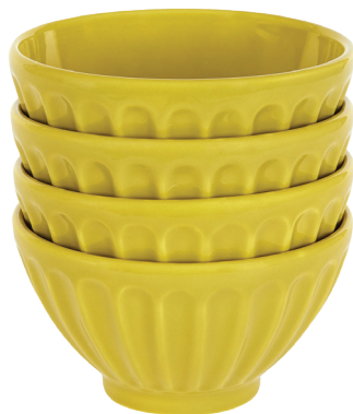
BOWLS £12, habitat.co.uk