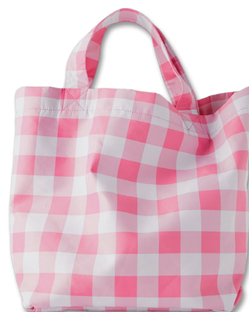
BAG £25.99, zara.com