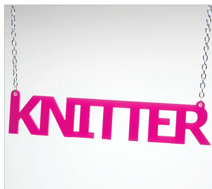
KNITTER NECKLACE From £10, maxsworld.co.uk