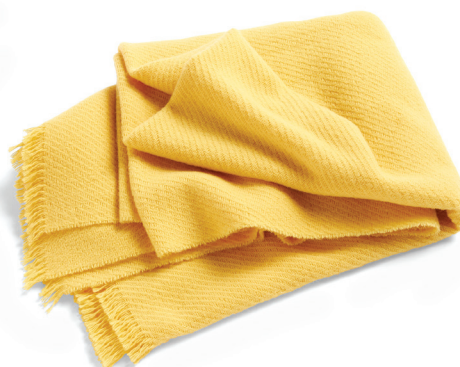
BLANKET £65, Hay at nest.co.uk