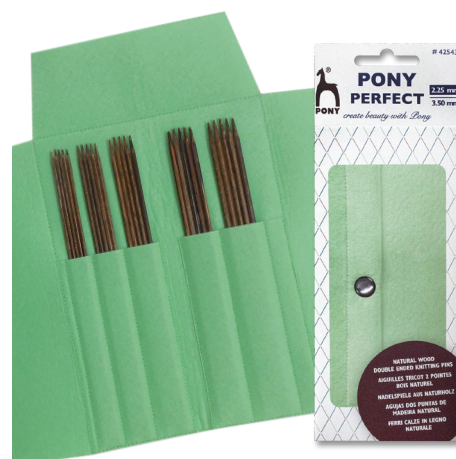
PONY PERFECT DOUBLE-POINTED NEEDLE SET £61, groves@stockistenquiries.co.uk