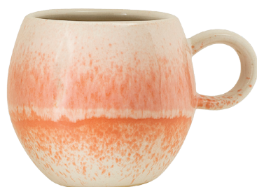
MUG £9.50, beaumonde.co.uk